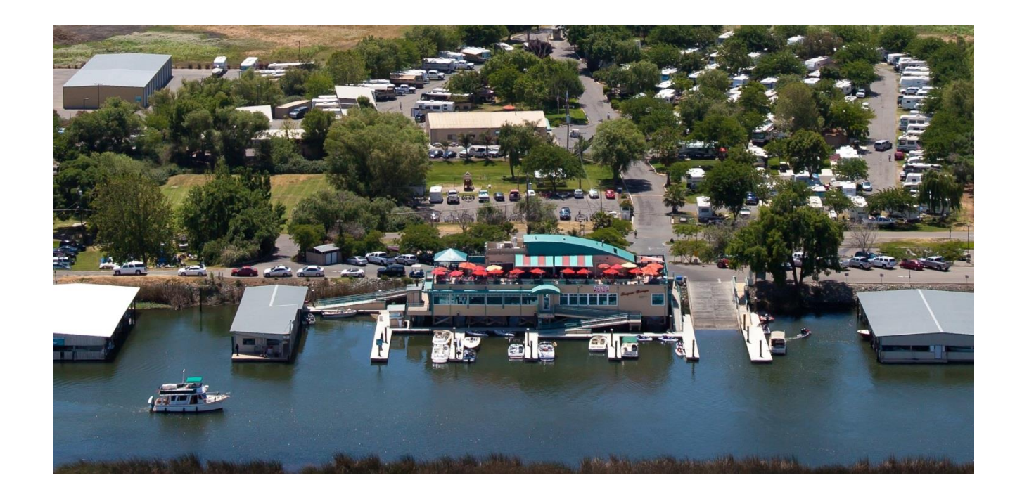
BETHEL ISLAND, CA