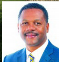
Antioch Mayor Wade Harper

All proceeds to non-profit fundraising for dedicated beneficiaries; Register & pay online at www.lonetreegolfcourse.com , , Make Checks to: Lone Tree Golf Course Non-Profit Tax ID #94-2826751 Mail to: Lone Tree Golf Course P.O. Box 2115, Antioch, CA 94531 Attn: Mayor's Cup. For Registration Info call (925) 706-4220